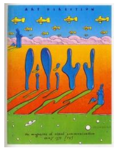
Lettering from Moscoso Book

The book is well done and in full color. It has a varnished cover and is sewn and glued. While the color is not as good as if it were offset-printed, it is quite adequate, in particular since quite a lot of the book contains drawings and rough sketches. What is in it?