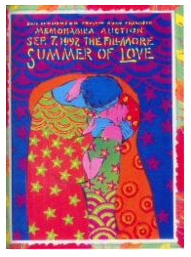
Summer of Love, Memorabilia Auction 1997

In addition are paintings, abstract art, innovative lettering, collage, and whatnot - most things I have never seen. As an archivist I was pleasantly surprised to find a complete annotated list of each image in the back of the book, complete with dates, sized, printing info, and so on. That is unusual.